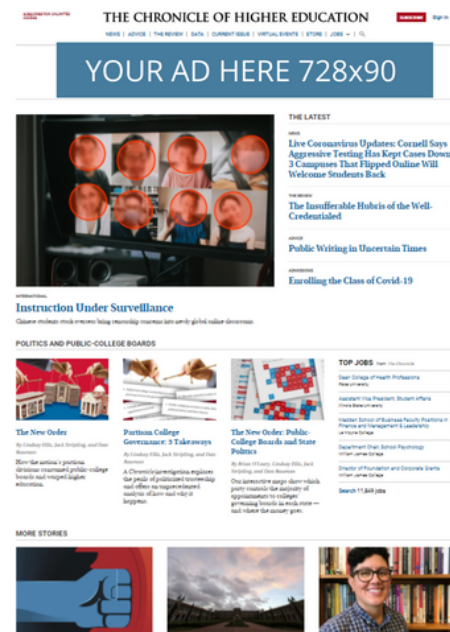
*ads are placed and enlarged for effect

Don't rely on broad, generic targeting on common ad platforms to market your company. Stand out with NASPA's uniquely qualified audience that will showcase your business to those who need you the most.