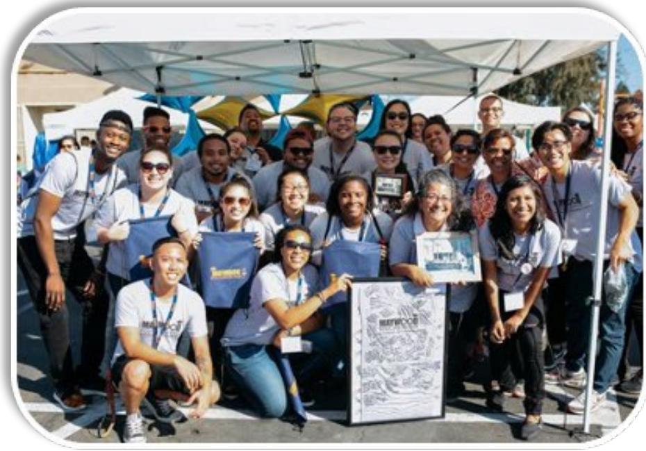
Service Learning Project connects with course