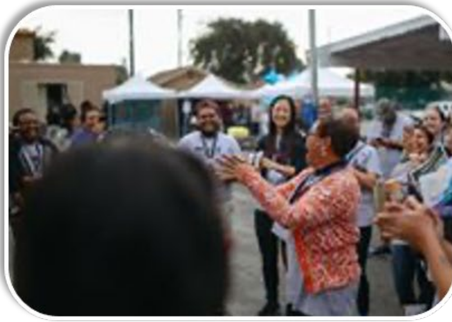
Cohort learns and collaborates with Southeast LA communities