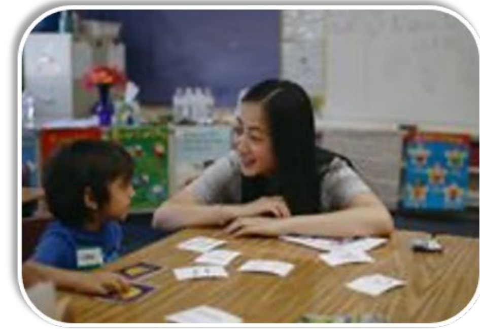
Students synthesize and apply their learning in a Practice to Theory to Practice (PTP)

View the 2019 Maywood Education Fair Video here .